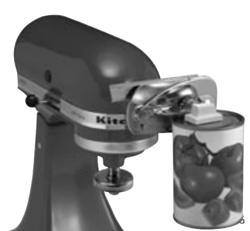
Model 5CO Can Opener Designed exclusively for use with all KitchenAid® Household Stand Mixers.